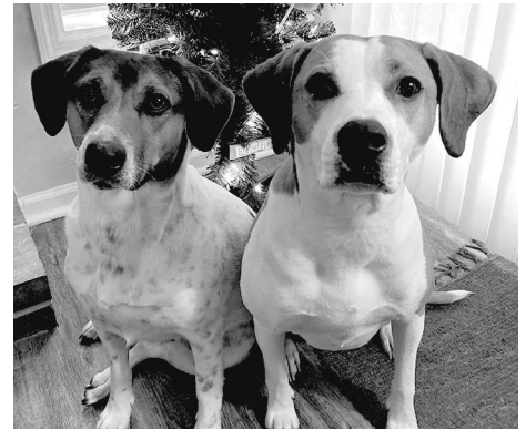
Our sweet girls