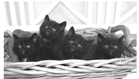
Stop littering, spay and neuter