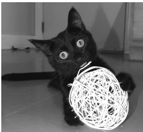
Balls are for fetching, neuter your pet

Here's the good news!! Bissell Awards $10,000 to our CCSNAP Program