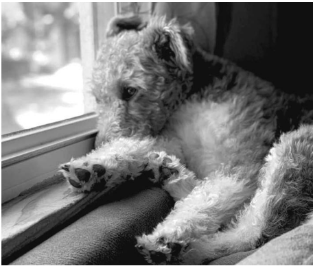
Our beloved Layla

Adopting saves two lives; the one you adopt and the one waiting to come into the shelter.