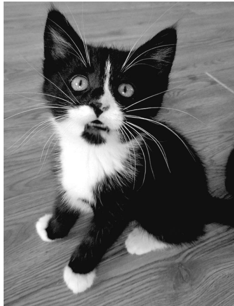
It's hip to snip

Noah's Ark's Caring Community Spay Neuter Assistance Program (CCSNAP) will kick off spring 2021 with a generous grant from the Bissell Pet Foundation targeting community cats, both owned pets and free roaming cats in a seven-county area in southeast Iowa.